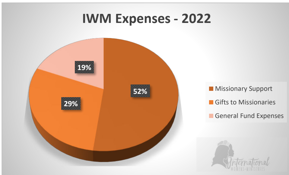
Above: Missionary Support comprised over half of our expenses in 2022, while Gifts to Missionaries were given out of the General Fund. The remaining twenty-nine percent of General Fund Expenses went toward regional travel as well as administrative costs, such as insurance or software.

IWM remains consistent and accountable as we serve women in ministry around the globe, wiping the tears of our sisters. Every donation given goes directly to the missionary for the purpose it was given. International Women's ministries never takes a cut or a percentage of any donation, nor does any board member of IWM receive compensation as they serve.